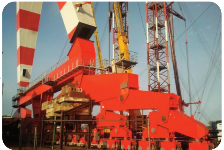
Above: Detail of Bogey

Fixed and hinged bogeys were completely assembled and ready to be installed. Fagioli SPMTs were inserted underneath the stability frames of fixed and hinged legs bogeys. The main girder was lifted until the bottom flange of the girder is at 66 m above the ground. Once fixed and hinged bogeys were set, Fagioli tower lifting system started lowering the crane legs onto the bogeys. Then the client proceeded to connect the legs with the bogey.