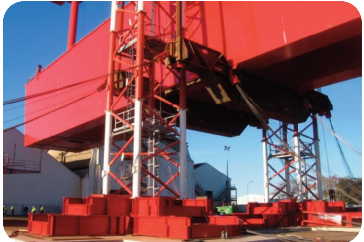
Above: Detail of lifting beams under the girder (Stage 1)

The third step involved assembling the main girder with the 2 heads (95 and 36 ton) of the fixed and hinged legs. The main girder was lifted by strand jacking system approx. at 6,5 m until the bottom flange of the girder was at 10,0 m above the ground, then the two heads were connected to it. Once the operation was completed, the main girder was lowered and stored on the ground on temporary supports.