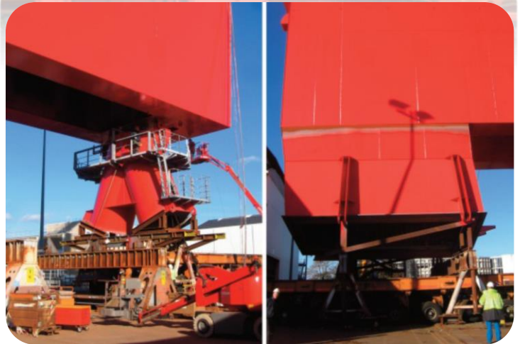
Above: Detail of legs' heads (Stage 3)