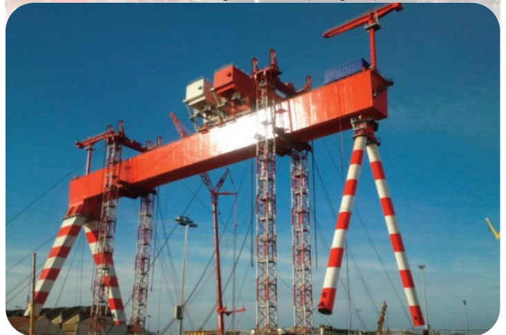
Above: Detail of the legs (Stage 5)